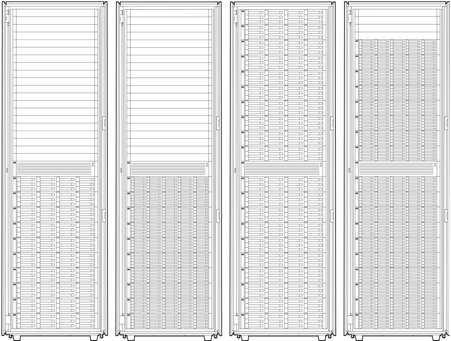
P6300 EVA 2C10D