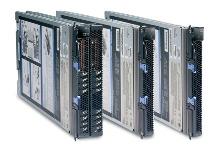
PS Blade Family

If you are looking for the perfect alternative to replacing traditional rack servers, then look no further. With a range of available PS blade choices and BladeCenter chassis supported you have the performance and scalability you need for demanding workloads of any sort. When combined with the BladeCenter S chassis, the PS blades become an ideal solution for deploying blades in an office and distributed enterprise environment. Unlike a stand-alone server that needs multiple power supplies and fans, individual systems management, numerous cables and a lot of space, IBM BladeCenter is compact and easy to use. By integrating servers, storage, networking and management, BladeCenter is helping companies in every industry sweep complexity aside.