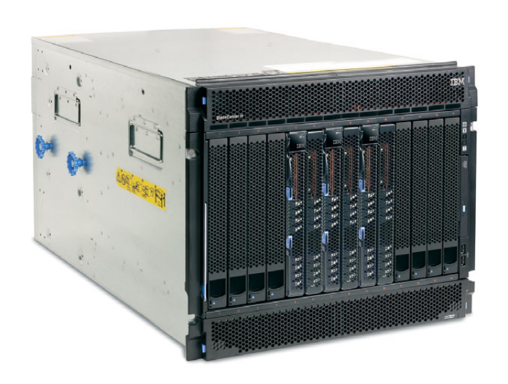
BladeCenter H with PS Blades

Simplify. Cut costs. Boost productivity. Go green. They're all priorities for IT, and they're all driving organizations to rethink their server strategies and become more receptive to new ways to use IT. Blades are the next-generation solution, promising improvements across the board. So toss your cables and take the leap. Migrate to the blade solution that uses less energy and gives more choices and control. You have nothing to lose but complexity. IBM BladeCenter is the right choice. Open. Easy. Green.